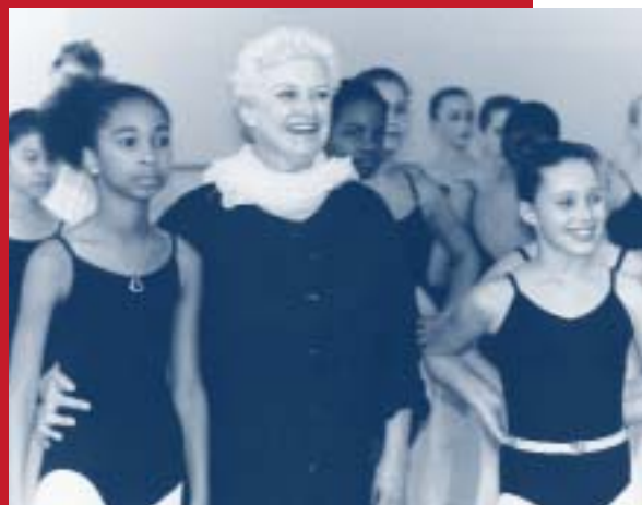
Violette Verdy, Rock School Artistic Director, former Artistic Director of the Paris Opera Ballet Company, Boston Ballet Company, Principal Dancer and Ballet Mistress for New York City Ballet, a renowned international master teacher, and recipient of numerous international awards.

A free performance at the Annenberg Center culminates the Rock School Summer Session.