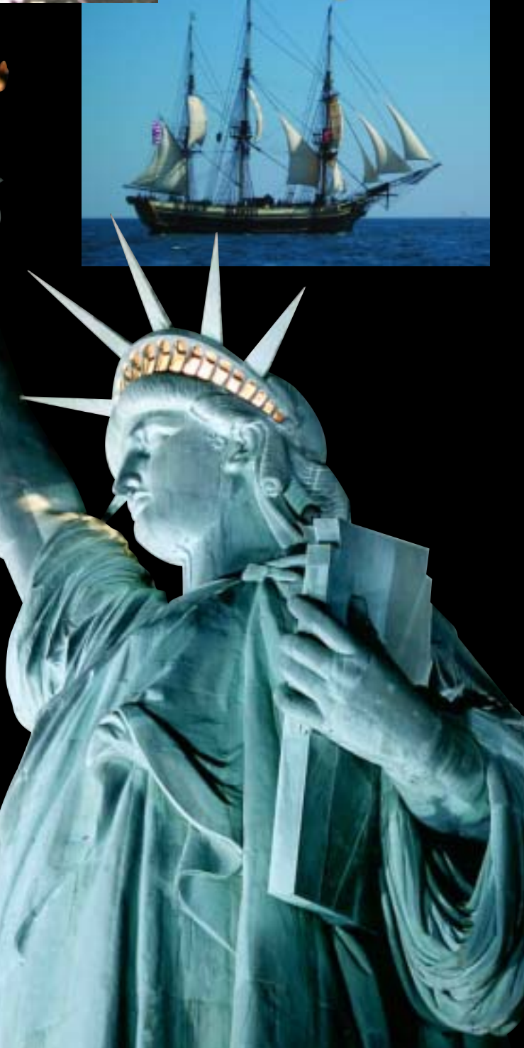
Statue of Liberty NM (right)