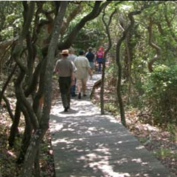
Salem Maritime NHS (below)

The colonial outpost at Fort Stanwix controlled a principal route from the Hudson River to Lake Ontario. During the American Revolution, American and Indian resistance, supported by the garrison at Fort Stanwix, played a major role in repulsing a British invasion from Canada, and directly contributed to the American victory at Saratoga.